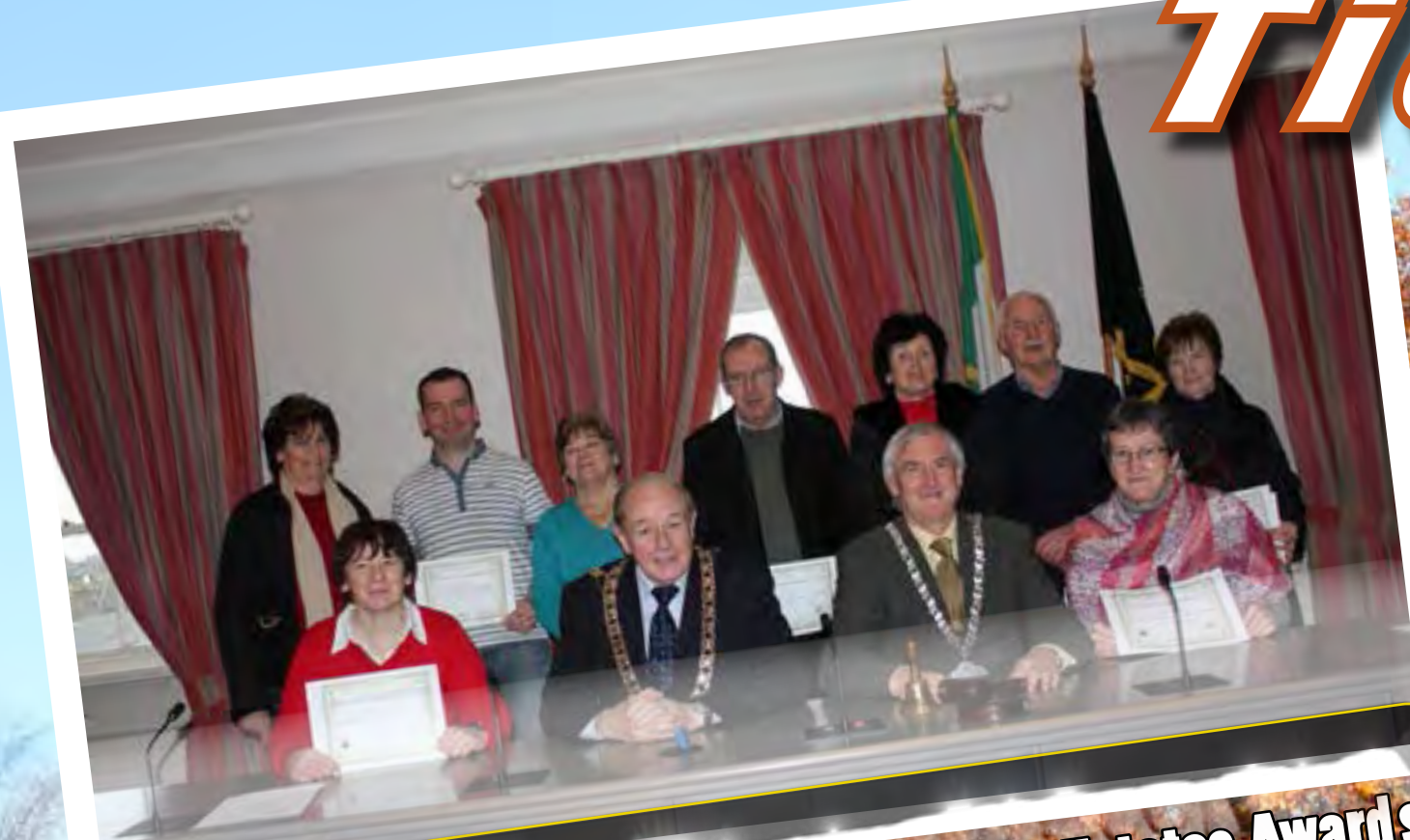
Winners of the 2013 Estate Management Tidy Estates Awards