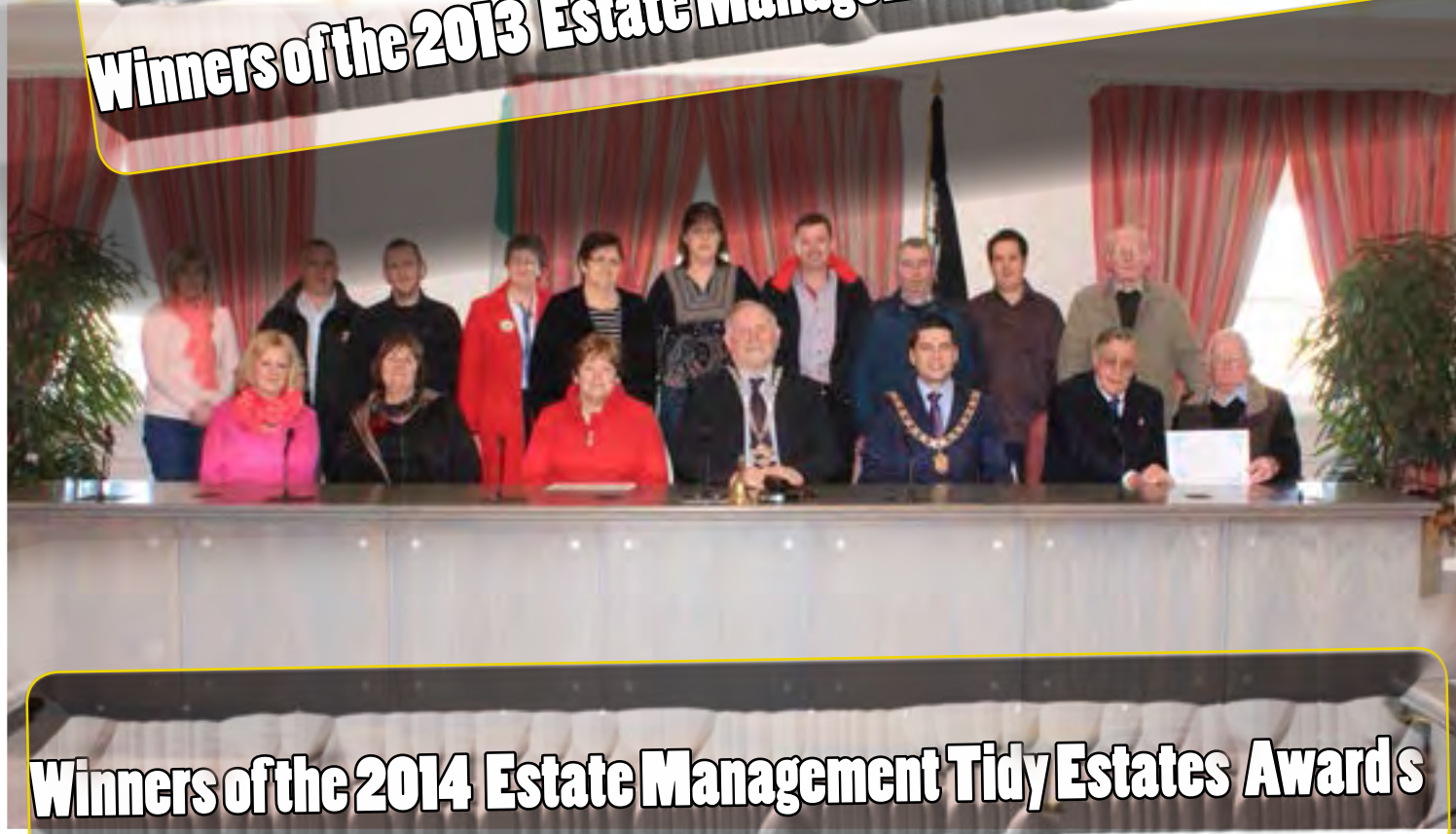
Winners of the 2014 Estate Management Tidy Estates Awards