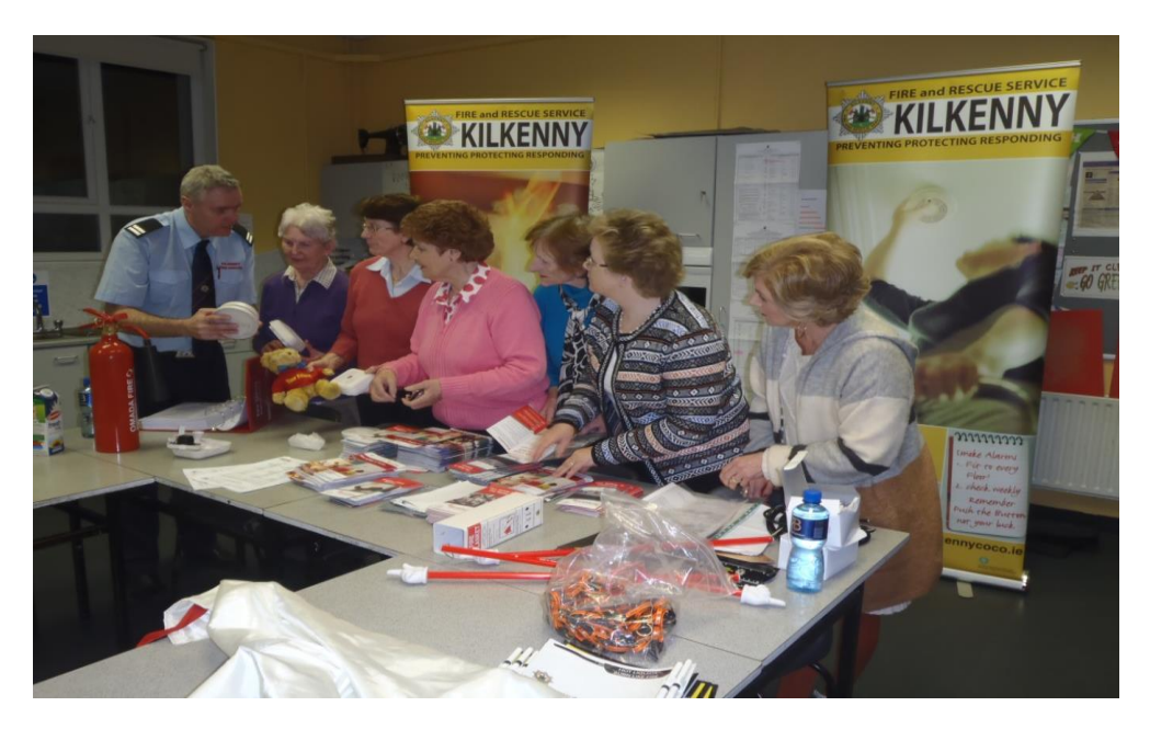
Fire Safety advice for Graiguenamanagh ICA