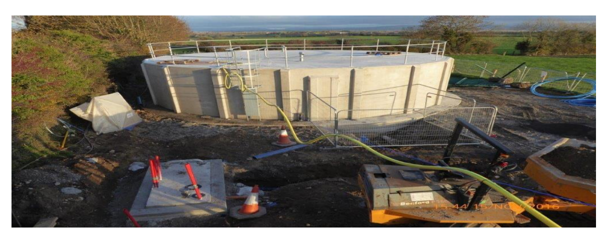
New Reservoir at Outrath

Works commenced in August 2016 on the upgrade of Outrath reservoir and associated works. The contract is due to be completed in Q1 of 2017.