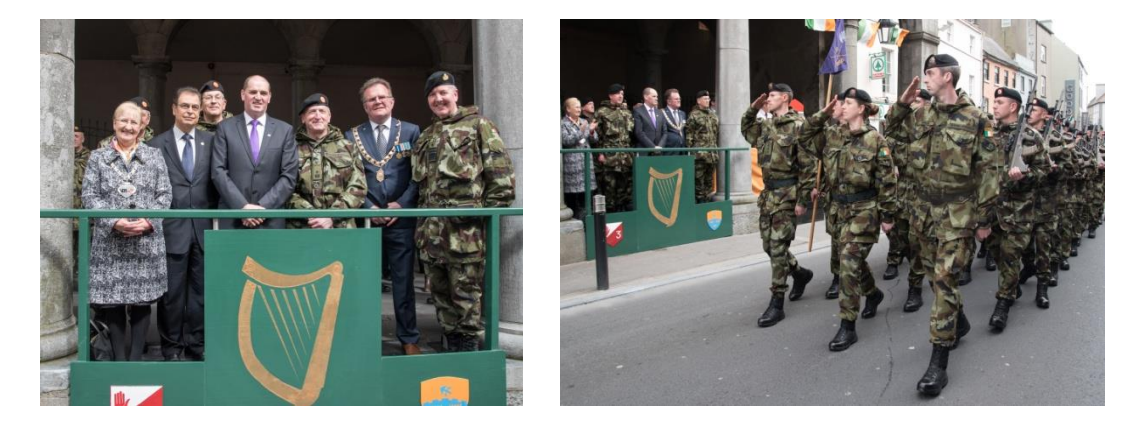
19<sup>th</sup> May, 2016:

Ministerial Review of Troops prior to their departure to the Lebanon.