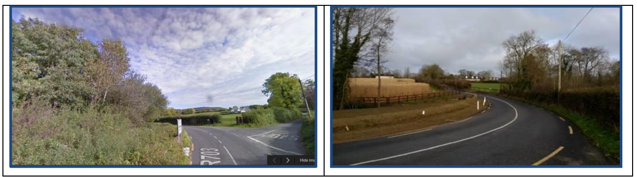
R703 Mong Junction – Before

The Non- National Low Cost Safety Programme is targeted at locations along the non-national road network which have been identified as collision prone zones. The works carried out under this programme include improved junction delineation and visibility splays, traffic calming, enhanced roadside delineation and pedestrian crossing facilitates within urban areas. In 2016 six schemes were completed under this programme at a cost of \in 225,000.