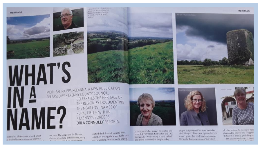
Article re the Kilkenny Field Name Project in "Ear to the Ground Magazine", Issue: Winter 2016.