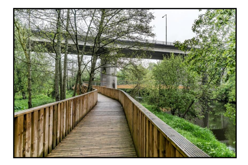
View of the Lacken Boardwalk connection to the new Ossory Pedestrian Bridge

The Parks Section has responsibility for development and maintenance of parks in the city and county. The River Nore Linear Park along with Newpark Marsh and Garringreen Neighbourhood Park and the recently developed Bishops Demesne are the main city parks. The parks provide a range of amenities both passive and active for people to enjoy. The parks are maintained and cleaned by litter picking crews weekly and grass is cut frequently in the growing season. Facilities with the parks such as playgrounds and exercise equipment are maintained and added to regularly. In 2016 work began on the development of a neighbourhood park for Ferrybank in the Aylesbury area. It is intended to be delivered in 2017 following public consultation with local residents.