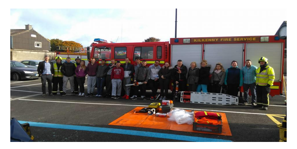
Visit of Kilkenny Youth Reach to Kilkenny City Fire Station