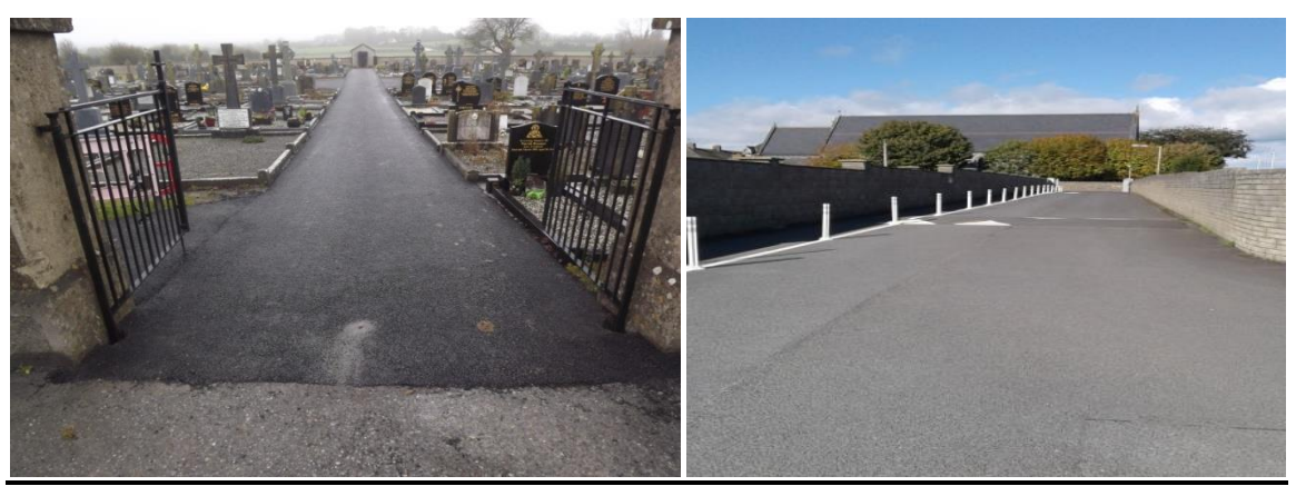
New access road at Freshford Cemetery.