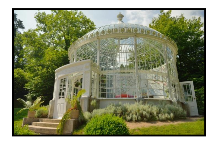
The Turner Conservatory in Woodstock which houses the tea room and is the venue of choice for many couples on their wedding day