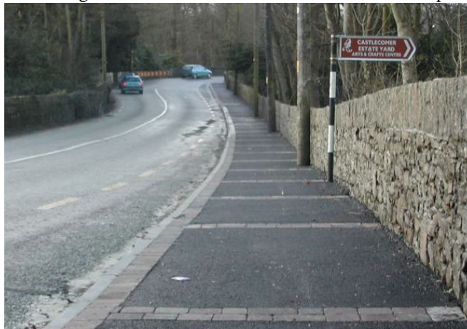
New footpath at Athy Road, Castlecomer

Other works include provision of new footpaths and footpath renewal, school safety markings, resurfacing of car parks etc. The works are approved in advance by your local councillors and are carried out throughout the county by your local area staff. This work will continue to be carried out with funds being allocated on an annual basis from the Development Contribution Scheme Fund.