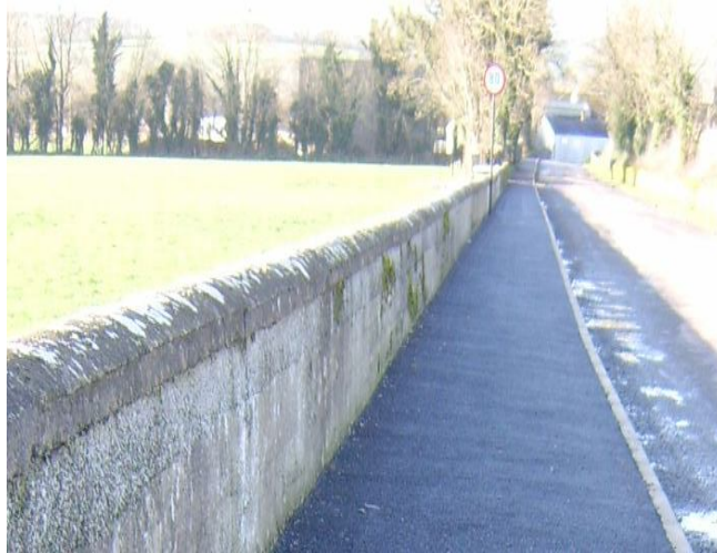
New Footpath at Tullaroan