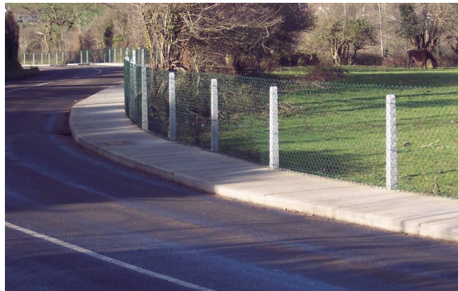
New Footpath at Slieverue

The development contribution is due upon commencement of development with the amount due being index linked to construction inflation. However, no inflation indexation increase will apply if development commences and contributions are paid within 6 months from the date of grant of permission.