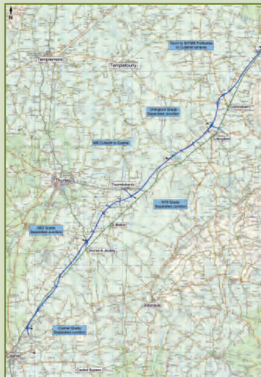
M8 Cullahill to Cashel Road Scheme Map

Roughan O'Donovan and RPS Consulting Engineers Joint Venture Valerie J Keeley Ltd, Margaret Gowen & Co. Ltd.