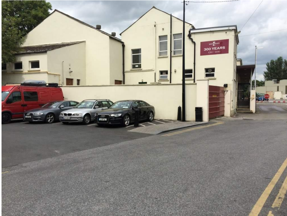
View of south elevation showing double pitched roof.

"Lisieux House", 5 Charlemont Terrace, Crofton Road, Dun Laoghaire, Co Dublin Tel No (01) 2020806/202 0807 Fax No (01) 230 1495 email roisin@rhanleyarchitects.com