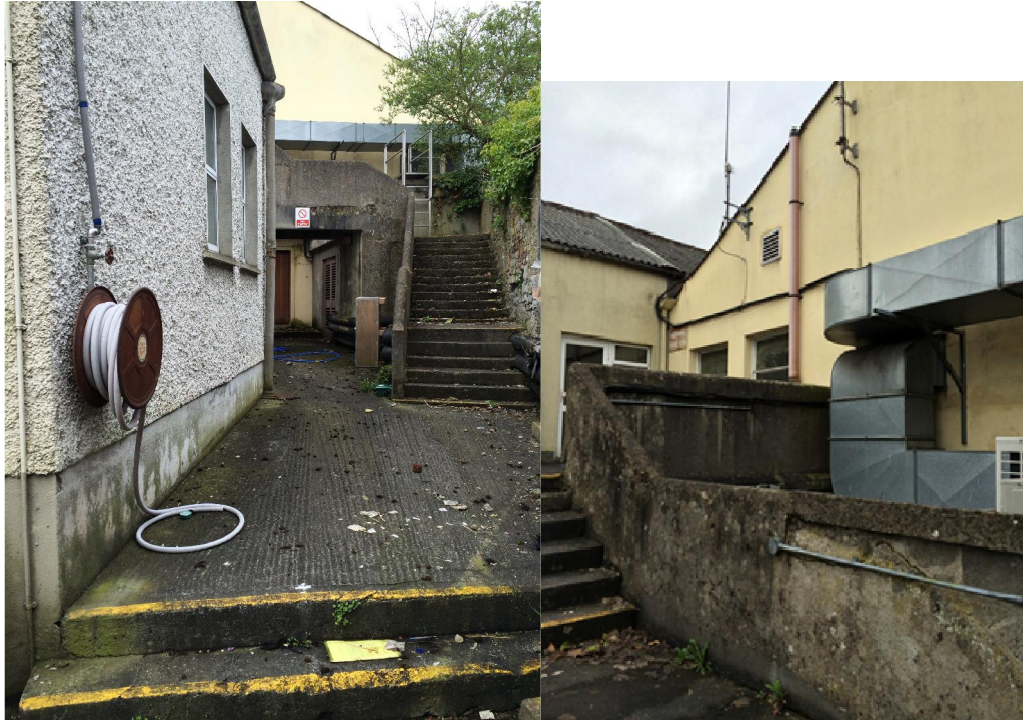
Service Yard to West of Existing Building detail of city wall to right of photo

"Lisieux House", 5 Charlemont Terrace, Crofton Road, Dun Laoghaire, Co Dublin Tel No (01) 2020806/202 0807 Fax No (01) 230 1495 email roisin@hanleyarchitects.com