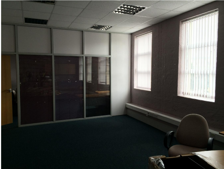
Interior of office showing ceiling tiles and doors which are not coeval to the original structure

"Lisieux House", 5 Charlemont Terrace, Crofton Road, Dun Laoghaire, Co Dublin Tel No (01) 2020806/202 0807 Fax No (01) 230 1495 email roisin@rhanleyarchitects.com