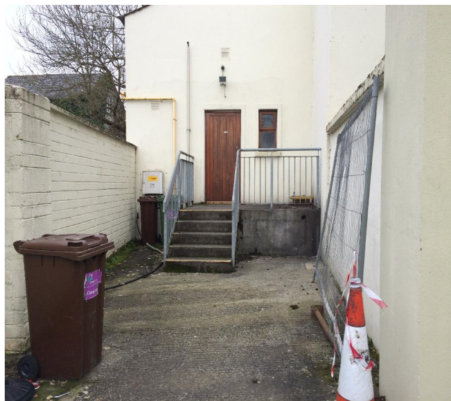
Service Yard to West of Existing Building detail of concrete wall and concrete steps