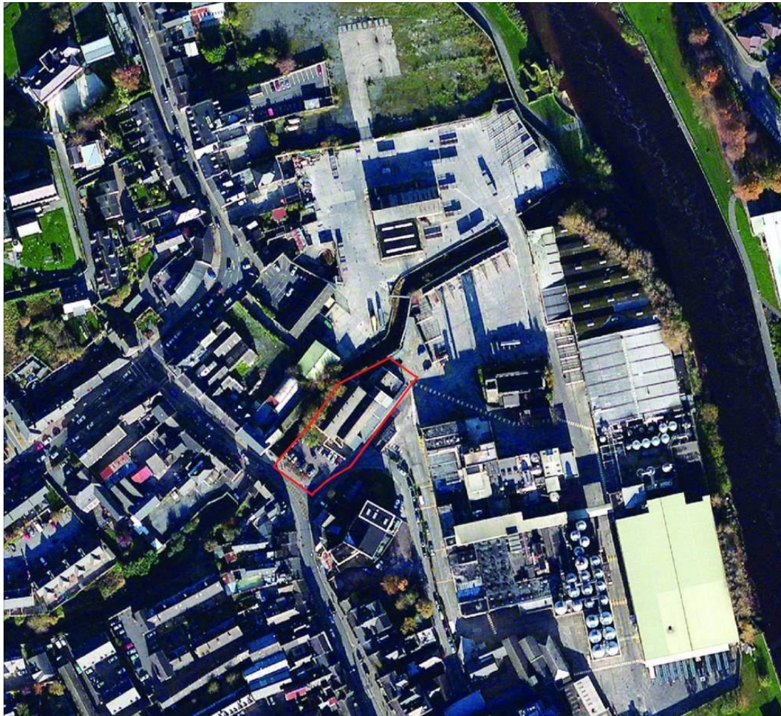
Aerial View of Site (outlined in red) and Local Context