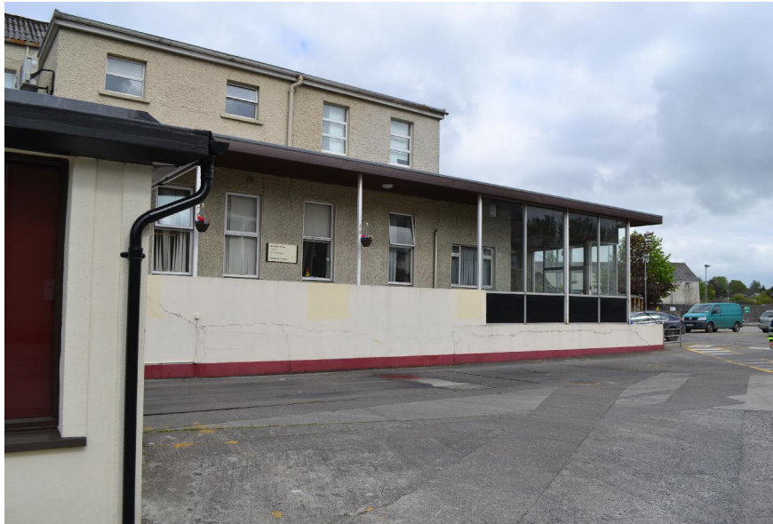
External canopy which is not coeval to the structure

"Lisieux House", 5 Charlemont Terrace, Crofton Road, Dun Laoghaire, Co Dublin Tel No (01) 2020806/202 0807 Fax No (01) 230 1495 email roisin@rhanleyarchitects.com