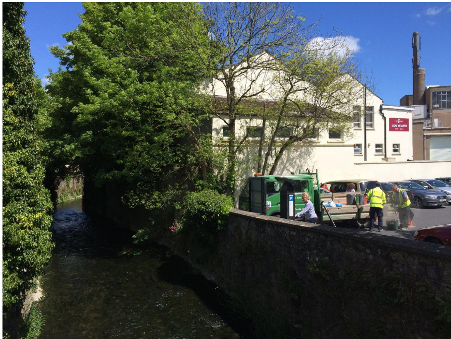
The city wall and Breaghagh River adjacent to car park