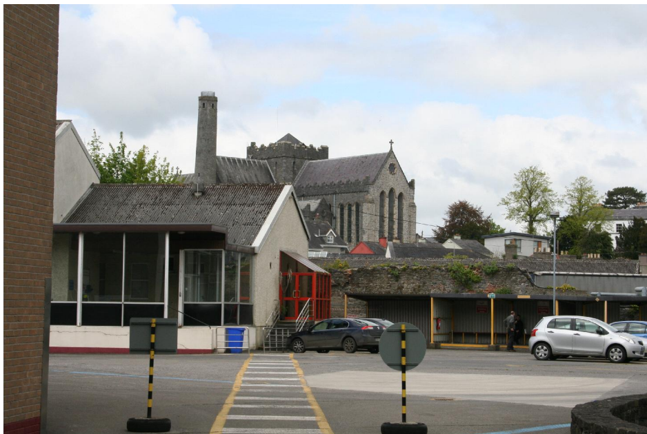
Asbestos roof of main structure. St Canice's Cathedral to rear. And city wall to rear