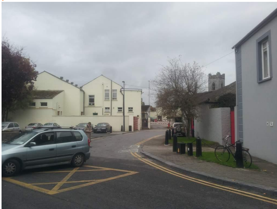
View of car park to South side of building in context