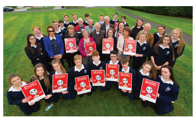
Anti-Dog Fouling Campaign (Ferrybank, 2016)

The Council acknowledges the role the wider community has in litter control and it must promote the anti litter message to ensure all individuals take responsibility not to create litter. A large sector of the community plays a significant role in combating litter by organising litter patrols and in rural areas some community groups take on the responsibilities of emptying litter bins locally.