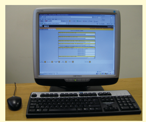
New search facility for contractors

The ETCI have recently made some changes to the Completion Certificate System and also incorporated some improvements, requested by RECI. ETCI Cert No. 1 is renamed 'Completion Certificate for Electrical Installations Less than 50kVA Installations' and the ETCI