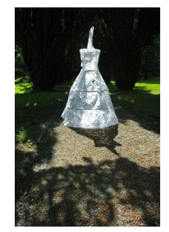
Above: Any day here teaches proportion, any walk sketches infinity. Carmel Cummins, Poet Below: Textile Dress by Caroline Schofield, Artist