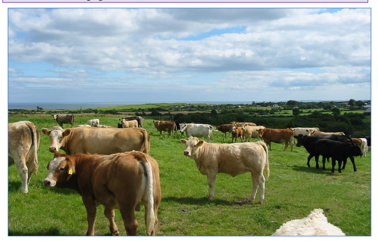
SECTION 4: Managing Fertilisers and Nutrients

This Section deals with managing fertilisers and nutrients on your holding. For the purposes of the Regulations , a fertiliser is any substance containing nitrogen or phosphorus used on land to help to grow crops (including grass).