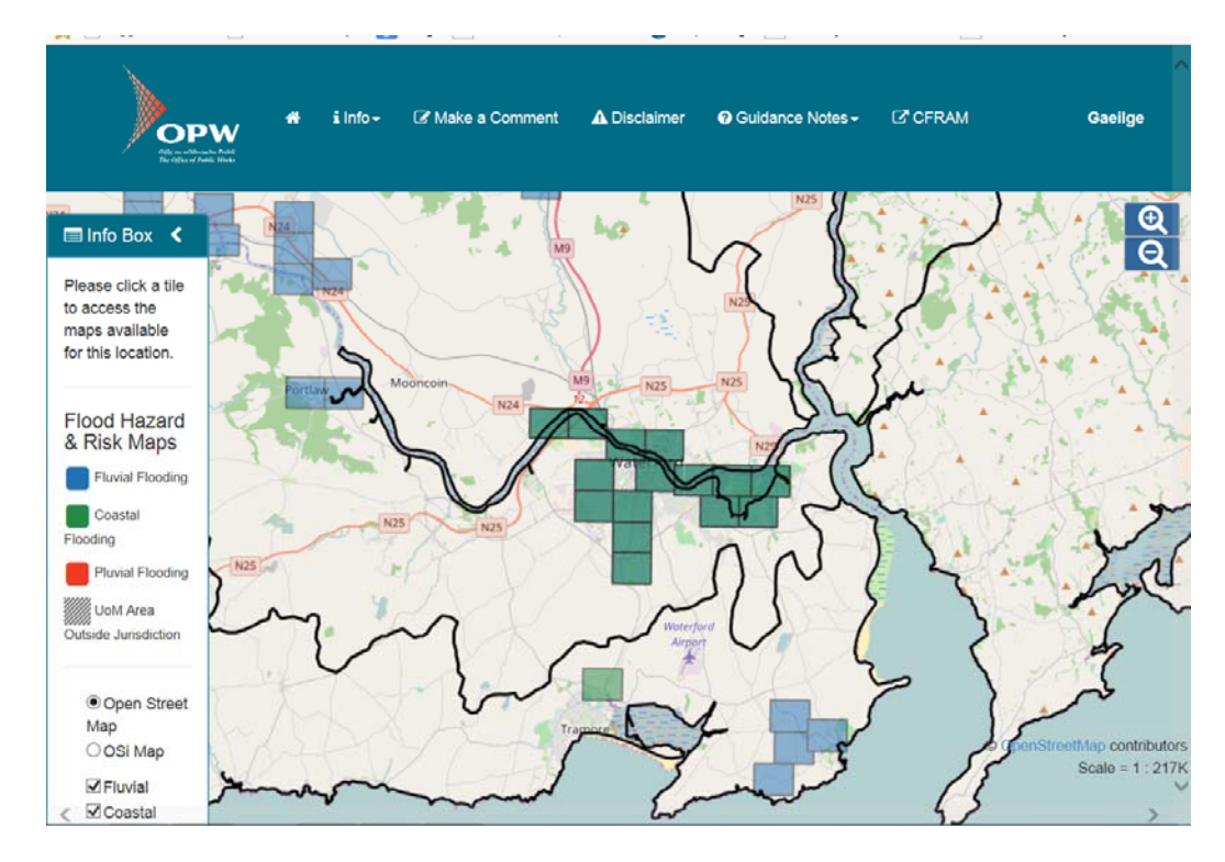
Figure 2.2: Available tiles in Ferrybank LAP area for CFRAM flood maps from OPW

The flood extents maps refer to flood event probabilities in terms of a percentage Annual Exceedance Probability, or 'AEP'. This represents the probability of an event of this, or greater, severity occurring in any given year. These probabilities may also be expressed as odds (e.g., 100 to 1) of the event occurring in any given year. They are also commonly referred to in terms of a return period (e.g., the 100-year flood), although it should be understood that this does not mean the length of time that will elapse between two such events occurring, as, although unlikely, two or more very severe events may occur within a very short space of time.