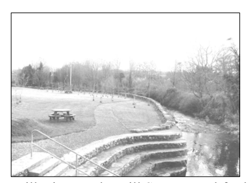
Millenium Park, Mill Street, Freshford

Mill Street is so called because of the Cascade Mills that once stood on the south side of the street. Beside the site of the former mills, the community have created a Millennium Park with a river walk. The park is landscaped and well maintained and provides a valuable recreational facility in the town. The entrance gates and bridge into the site are the only remaining remnants of the protected mill complex.