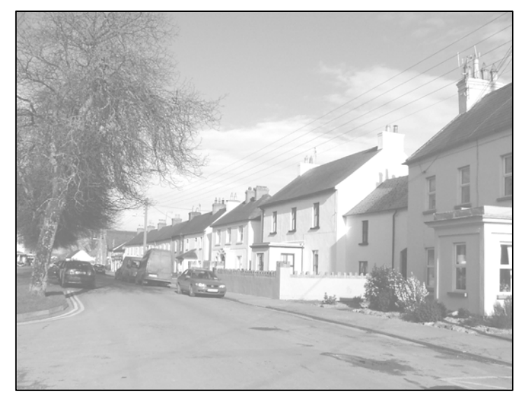
East side of the Square

and commercial uses although today it is chiefly residential. (See photo right). In the past this stretch of road housed the RIC barracks, the curate's house, the doctor's house, a petrol station, public house and shop. Today the doctor's house and barracks are private dwellings. The old curate's house, located beside the Roman Catholic Church, is in use as a private nursing home. While the public house and shop remain, the petrol station is closed but retains the old pumps to the former forecourt.