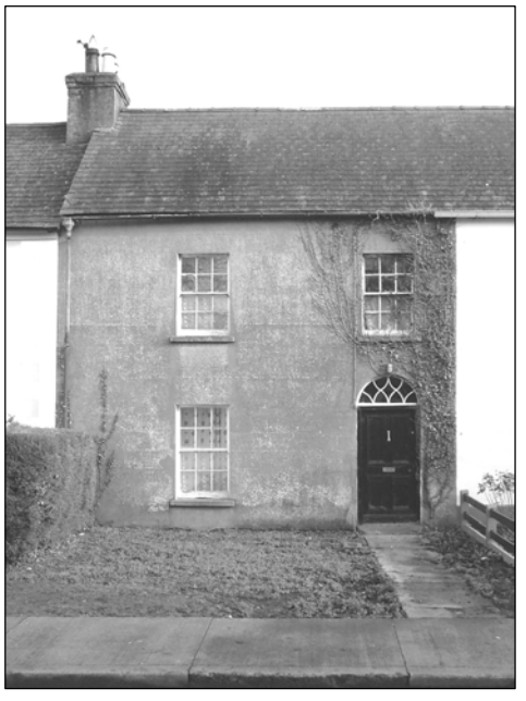
Terraced two-storey house

The predominant building type on the Square is a terraced two-storey house with rendered finish to the exterior walls and a single-span pitched roof. A variation of this type is a terraced two-storey house with a pub or shopfront to the ground floor. Dating to the mid to late nineteenth century, this building type is commonly found throughout Ireland and makes up the architectural stock of many Irish towns and villages. Building materials typically found in these structures include stone, brick, timber, slate and lime or cement mortar and render. The building lines and rooflines of the structures were informally standarised while the position and form of door and window openings were usually duplicated throughout. The overall effect created by the standard building type and use of construction materials is one of consistency and uniformity.