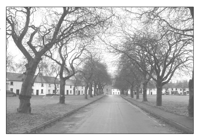
Tree-lined avenue through the Square

The Square in Freshford is an open, well-defined space contained by terraces of houses and rows of buildings facing onto the Square. Its sub-rectangular plan is bisected diagonally by an avenue, which creates an impressive vista. Though of irregular shape, the planting of the dwarfed variety of horse chestnuts gives the square uniformity, formalising the green and positively contributing to the character of the space.