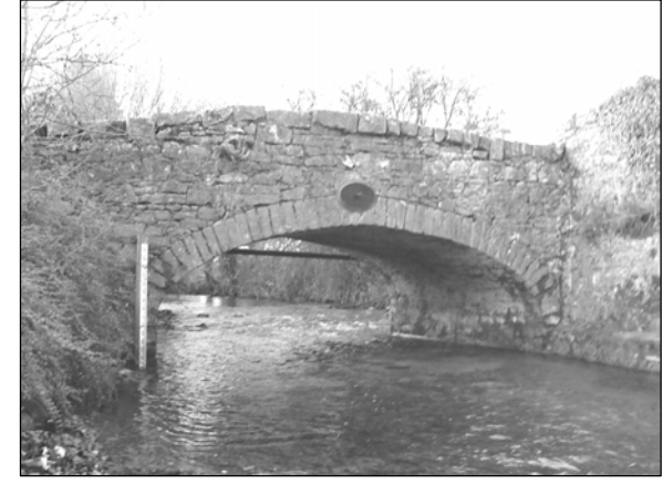
Hospital Bridge, Clintsown Road

canopy over the service area, this modern infill development breaks the building line of the street. There is a public house located on the south side of the street and its brightly painted front elevation is an attractive feature. At the end of Kilkenny Street, a road known as Clintstown Road runs in a northerly direction. At their junction is a small triangular green area with parking spaces and the town's recycling facilities. This green area is bounded on two sides by the Nuenna River and a small tributary.