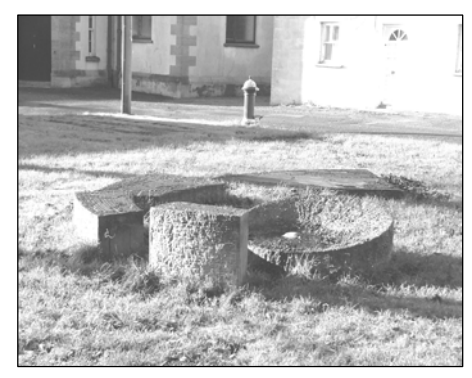
Limestone sculpture on the Square

Today the Square at Freshford is predominantly used as recreational grounds. Features of note include an untitled piece of sculpture by Ian Lazarus, installed in 1996, consisting of five pieces of Kilkenny limestone. The artist describes it as '...a contemplative piece for people to sit and dream on. It is based on a simple spiral going into itself with a complex skin.' 8