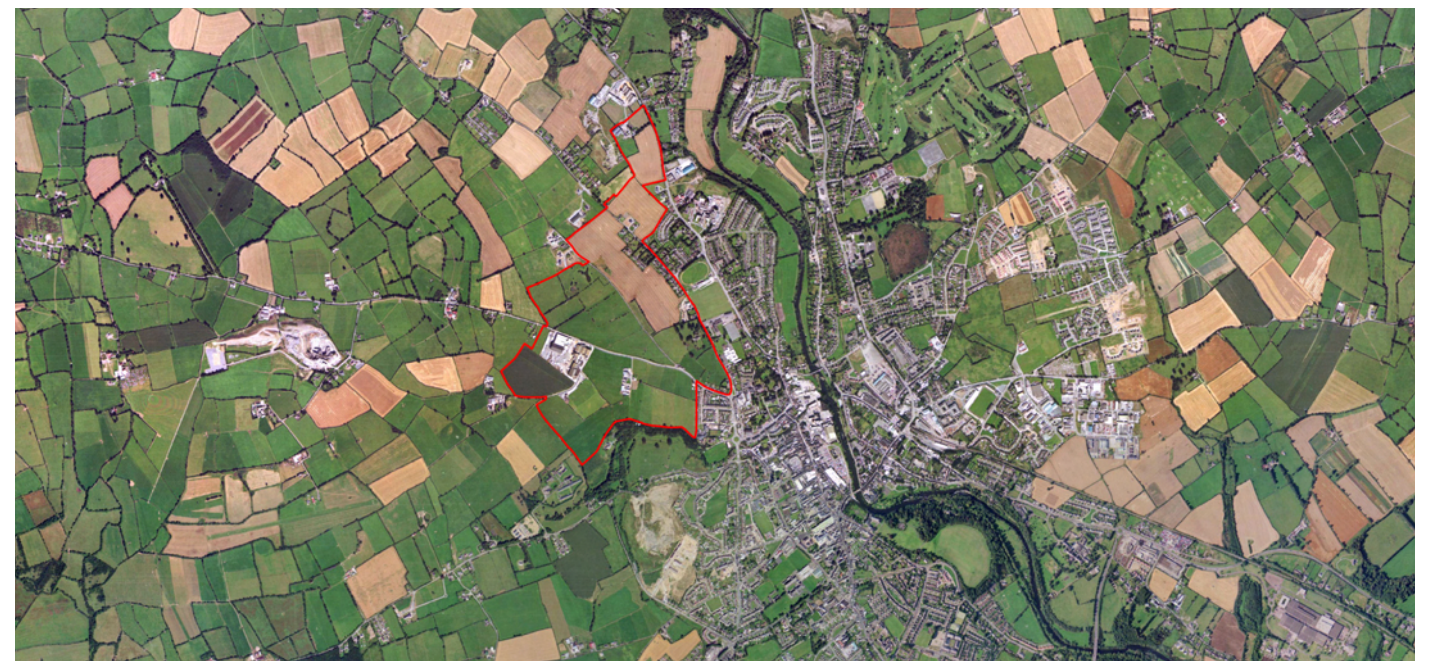
Fig. 1. Aereal map of LAP boundary and context