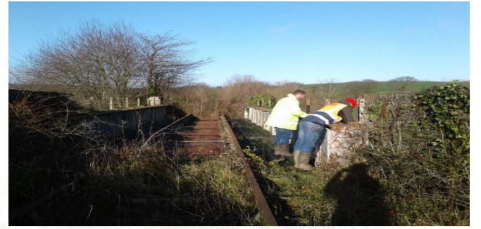
Examining the old bridge structures following vegetation clearance