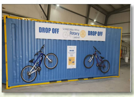
Handover / Storage Container at Dunmore Civic Amenity Centre

This is a major result for Rotary Ireland and it will mean that nationally they, in conjunction with other stakeholders, should be able to significantly multiply the impact of this great project into the future.