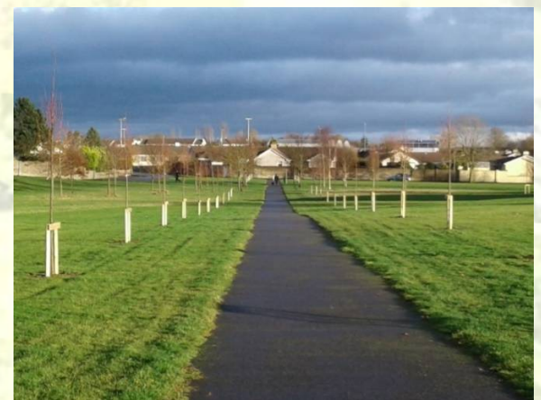
Newly planted lime tree avenue Loughboy Park

The Parks Section has completed its programme of tree planting in the city and county commemorating а number of special anniversaries. The planting programme is the beginning of our commitment to increase tree planting county wide to assist in addressing Climate Change. The trees are all native and or pollinator friendly and were semi mature in size at planting. Sadly, some of the trees planted in Lintown Hall have been broken by persons unknown. These will be re-planted immediately in an effort to reinstate the avenue of trees which once stood here.