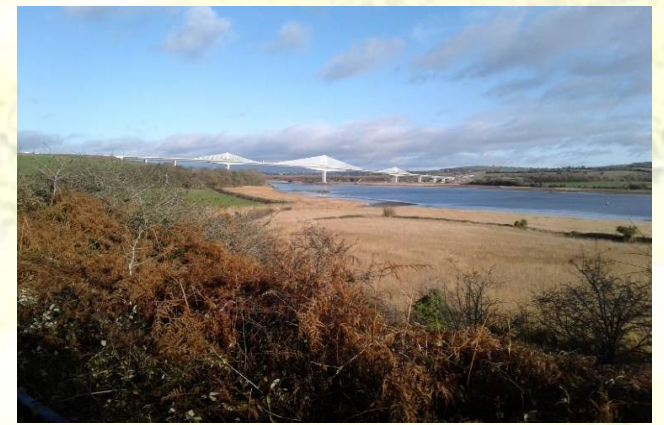
View of the recently opened Rose Fitzgerald Kennedy Bridge from the old railway line at Carrickcloney.

Upon completion of this phase of works, the detail design can be completed and the tender documents finalised. Contract documents must then be sent to the Department of Tourism Transport and Sport for approval following which the project will go to Public Tender for the construction phase. It is anticipated works will commence on site in September 2020 with a completion date being set at December 2021.