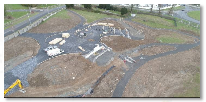
Aerial view of Ferrybank Neighbourhood Park

The construction of the park will create a much needed central amenity facility for Ferrybank, incorporating a children's playground, walking route, teenager meeting point, and playing pitch.