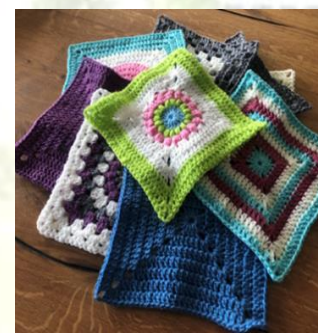
Pictures of some of the squares knitted or crocheted by our volunteers