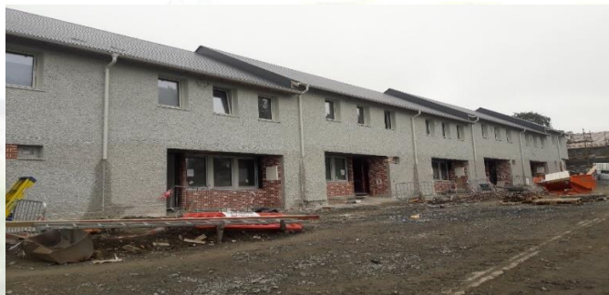
Glebeside, Donaguile, Castlecomer 33 units under construction

38 units Hoban Park, Bolton Callan, 28 units Nuncio Road, Kilkenny ( Respond Housing ) 17 Units at Breaghagh Place, Main Street, Piltown 33 units at Glebeside, Donaguile, Castlecomer 6 Units at New Road and Chapel Street, Mooncoin 22 units at Station Avenue, Ballyraggett 40 units Margaretsfield, Callan Road, Kilkenny 4 units ( Group home ) at Cloghabrody, Thomastown 1 unit at 47 Barrack St, Castlecomer ( Buy & Renew ) 1 unit at Old Health Centre, Windgap ( Buy & Renew ) 1 unit at Main St, Kilmoganny ( Buy & Renew ) 18 units at 'Broguemaker', Castlecomer Road, Kilkenny