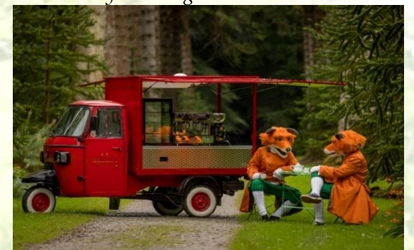
Local 'wildlife' enjoying a quiet moment in the gardens at the coffee van which is now offering refreshments to visitors