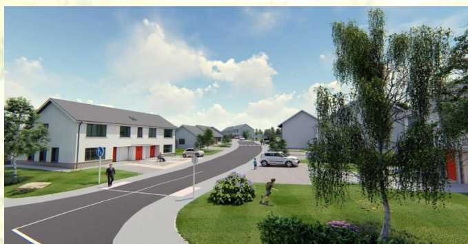
Ladywell, Thomastown – 25 units currently at Planning Stage with An Bord Pleanála