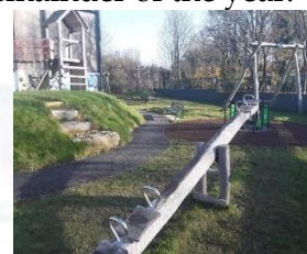
Playgrounds at Windgap & Mullinavat