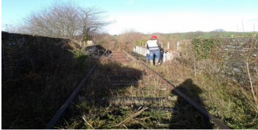
Examining one of the old bridge structures along the route of the South East Greenway at Carrickcloney.

keep them updated on progress. It is anticipated works will commence on site in September 2020 with a completion date of December 2021.