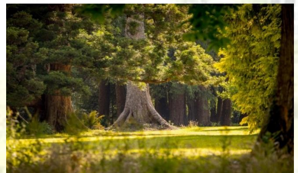
Some early morning sunshine in Woodstock