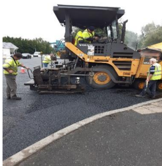
Paving works at Kilkenny Road Callan

maintenance which alone accounts for 158 separate projects. All this work is carried out by our own crews through the Municipal Districts and the Machinery Yard.