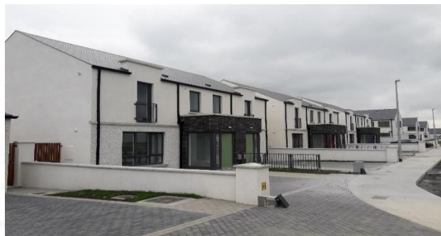
Completed Scheme at Hoban Park, Bolton, Callan

The Incremental Tenant Purchase Scheme (IPS) allows for social housing applicants and social housing Tenants to purchase 'designated' newly built local authority houses at a discount.