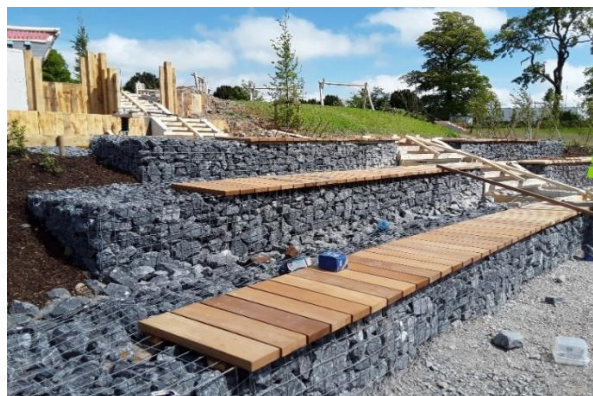
The terraced seating area in Ferrybank Neighbourhood Park. As the site is on elevated ground, there are great views of Ferrybank and Waterford City from this area.

The park is being jointly funded by the Department of Housing, Planning, and Local Government, Kilkenny County Council and Waterford City and County Council.