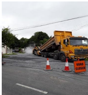
Surface Dressing at Milebush