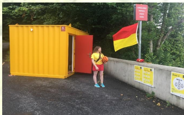
New Lifeguard Hut 2020 – Purchased by Kilkenny County Council