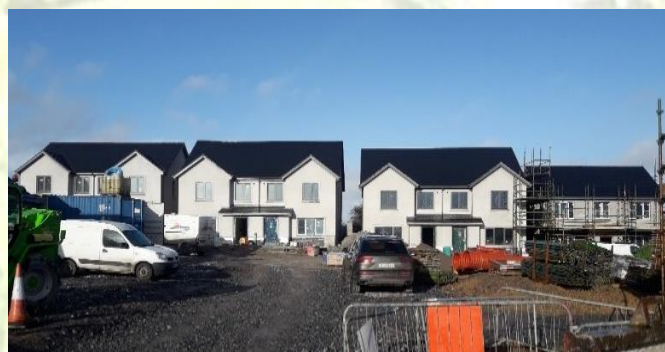
Breaghagh Place, Piltown – 17 units under construction

These developments consist of 111 additional housing units.