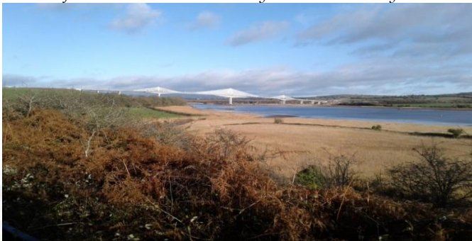
View of the recently opened New Ross By Pass bridge from the old railway line at Carrickcloney.