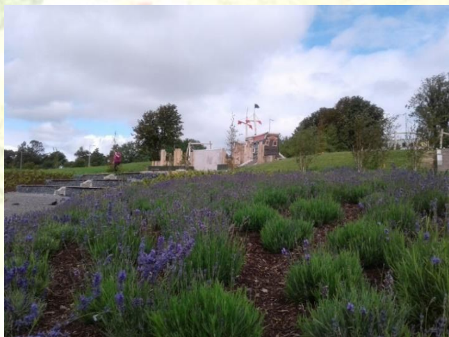
A lavender bed planted for scent and for pollinators. Located near seating area in new park in Ferrybank

The 166 groups that applied for grant assistance under the Amenity Grant Scheme for 2020 have been informed of their allocation. All were awarded grants ranging from €454 to €2,270. The works funded cover the spectrum from landscaping, grass and meadow maintenance and development of open spaces through to the provision of street and outdoor furniture and small-scale improvement works. In 2021, there will be a focus placed on supporting pollinator projects and advice to this effect was sent out to all applicants. Community groups will be encouraged to manage amenities in a more sustainable manner.