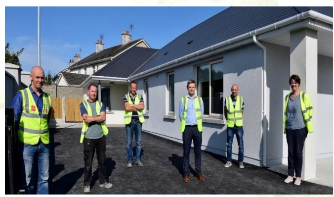
Handover of Group Home, Cloghabrody