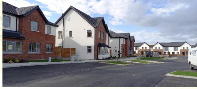
28 houses at Nuncio Road, Kilkenny