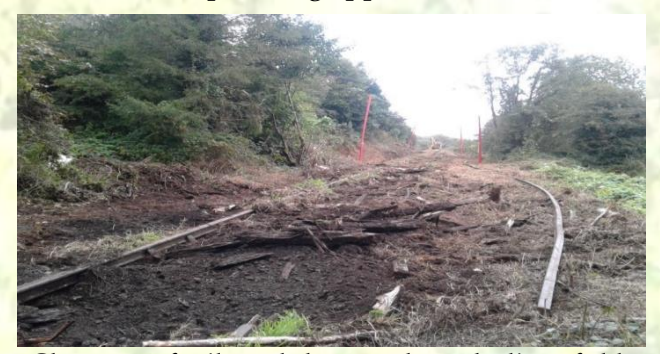
Clearance of rails and sleepers along the line of old railway track on the South East Greenway

Part 8 planning applications for Greenway Car Parks to facilitate access to the Greenway at Raheen, New Ross, Ballyverneen, Glenmore and Ferrybank are currently being considered by the Planning Authority. These applications were on public display in the Ferrybank Area Office, County Hall Planning Office and in New Ross Municipal District Offices. The open period for receipt of submissions has now passed. All submissions received will be considered by the Planning Authority when arriving at a final decision on the planning applications.