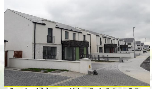
Completed Scheme at Hoban Park, Bolton, Callan

6 Affordable home for sale in Hoban Park, Callan, Co. Kilkenny