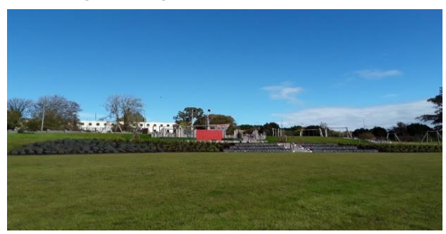
The terraced seating area in Ferrybank Neighbourhood Park.

As the site is on elevated ground, there are great views of Ferrybank and Waterford city from this area which can be used for performances or informal gatherings in the future.