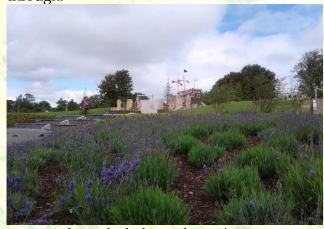
Lavender bed near the seating area in the new park in Ferrybank

The aim will be to manage the park as a pollinator friendly space. Grass cutting will be kept to a minimum around more formal or entrance areas. Elsewhere longer meadow grass will be maintained with an annual cut and lift approach taken. This will encourage a more diverse grass sward with wildlfowers in the seed bed coming through.