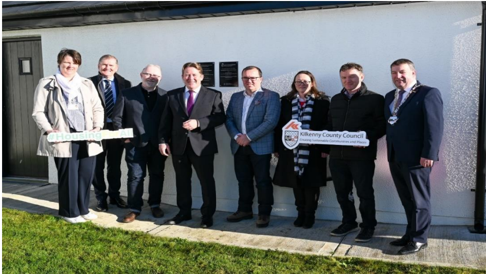
Station Avenue, Ballyragget

In November 2022, Minister Darragh O'Brien was welcomed to Kilkenny to officially open a number of housing developments and to view other projects underway. While Kilkenny County Council have a strong delivery pipeline under the Housing for All Programme the target for delivery in 2022 of 170 units will not be met. Delivery for the year 2022, of substantially complete new build housing units will be 166. In addition to this delivery, 14 acquisitions and 3 units under the Traveller Accommodation Plan will also be delivered giving an overall social housing delivery for the current year of 183.