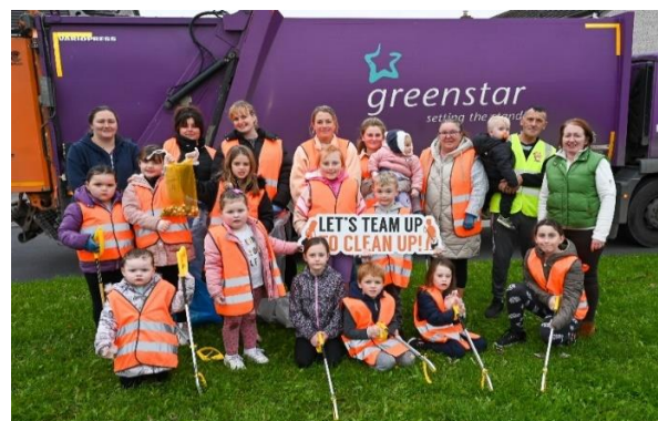
Loughlin Court, Kilkenny