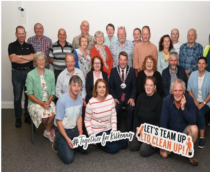
Tidy Towns Forum in Ballyragget