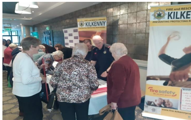
Fire Personnel giving fire safety advice at the Kilkenny Older People's Council celebration in the Kilkenny Ormonde Hotel.

Stations despite the inclement weather conditions.