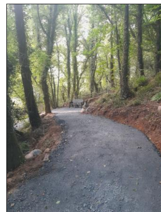
Completed works (L to R)

Ardra Loop Walk - Castlecomer Discovery Park, Johnstown Community Walk and Silaire Wood Loop Walk