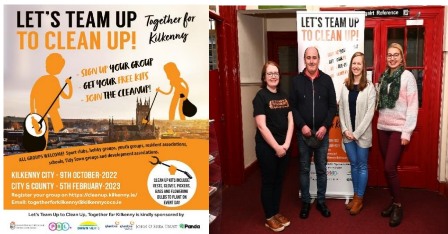
Advertisement Poster and Volunteers at the Library Information Safety Session

“Lets Team Up to Clean Up, Together for Kilkenny” preparations are underway, as groups continue to sign up for the City initiative on the 9 th October 2022. Planning is already underway for next February’s whole county environmental day of action. The Environment Section was present at the Iverk Show hosting information about the whole county event. At the end of September, 55 groups registered with all groups agreeing to litter pick their local neighbourhoods between 10.30am-12.30pm on the 9 th of October 2022. Each group has received flowering bulbs which will bloom all over the city next spring, amounting to approximately 6,000 new pollinator friendly flowers.