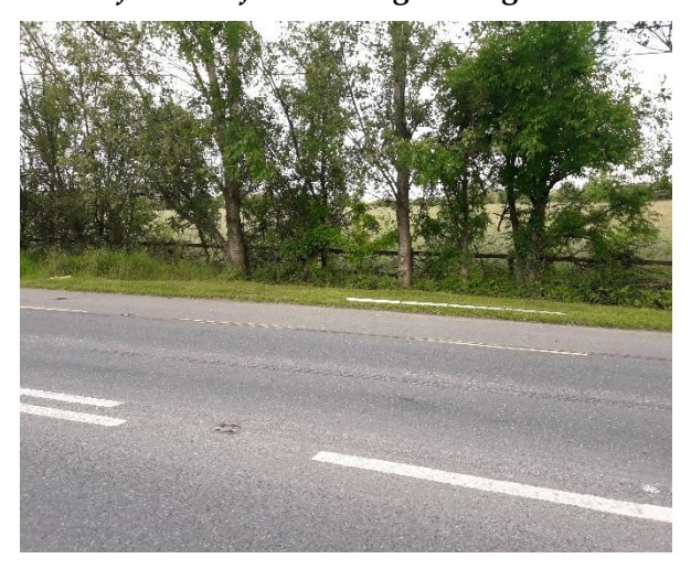
Before & After Fencing Arrangement

This programme has continued in 2021 and works on the N76 at Cuffesgrange and Tullaroan for a combined value of approximately €100,000 have been completed to date. Planning for the next set of works continues and subject to funding allocations in 2022 it is expected that further sets of works will be procured in 2022.