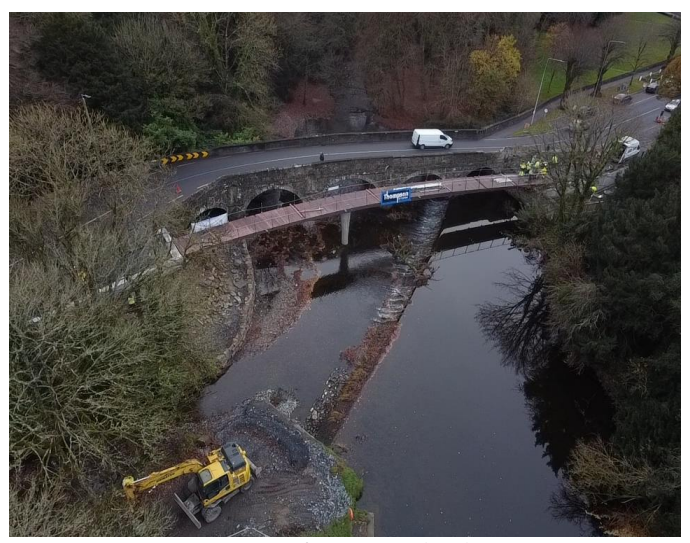
Drone view of new Footbridge & Existing Road Bridge.