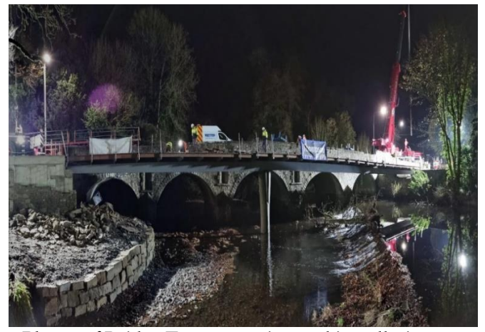
Photos of Bridge Transportation and installation on night of 23<sup>rd</sup> November 2021