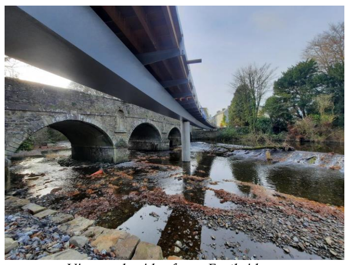
View underside of new Footbridge