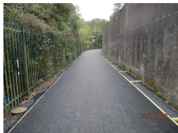
Laneway From Dublin Road To Bishop Birch Place Before & After