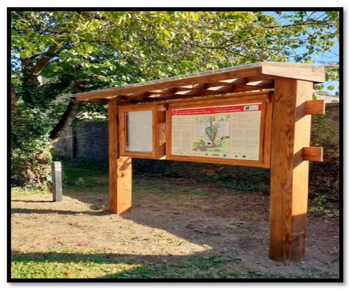
New Trail Head Signage

Woodstock Estate: Accessible Trails, Age Friendly & Disabled Parking & Accessible Play Equipment Works to improve access for all to the gardens has been ongoing. A new pathway has been constructed from the carpark to the playground and significant surface restoration works was completed along a series of existing pathways, including the Monkey Puzzle and Noble Fir Avenues. On both avenues an unbound gold coloured stone material has been used, the properties of this material not only provide a very attractive finish but also make the area more accessible for people with mobility issues.