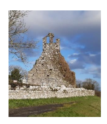
The Bell Tower at Clomantagh Church will be repaired

Grant aid of €85,000 for urgent works to stabilise and conserve the 13<sup>th</sup> Century church ruin including its distinctive double bell-tower, walls, doors and windows of the church.