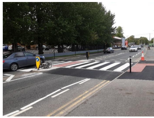
Provision of Road Crossing at Callan Road