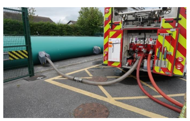
Freshford Fire Brigade carrying out an exercise at a static storage tank in Ballyragget.

Suitability tests for new fire Fighters for Kilkenny City, Callan and Graiguenamanagh Fire Brigades took place in Kilkenny City Fire Station. These tests included Comprehension Test, Ladder Climb Test, Equipment Carry Test, Casualty Evacuation Test, Confined Space Test and a Dexterity Test.