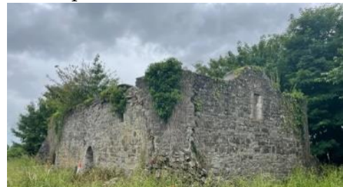
Dunkitt Church walls will be stabilised

Works have commenced on the Clomantagh site in August 2022 and works are scheduled for Dunkitt in September 2022.