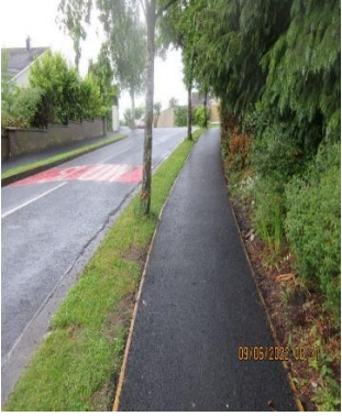
Footpath Repairs At Glendine Before & After