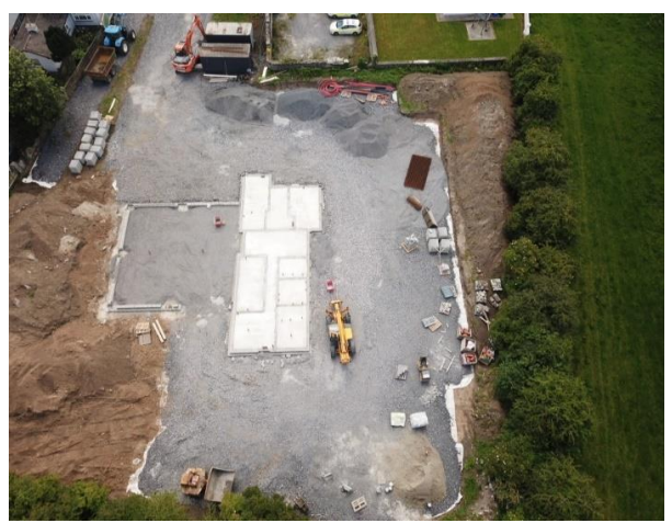
Aerial photo shows the foundation for the new Fire Station.

Construction work has commenced on the new Fire Station for Urlingford. Good progress is being made by the contractors on the building of the new Fire Station.