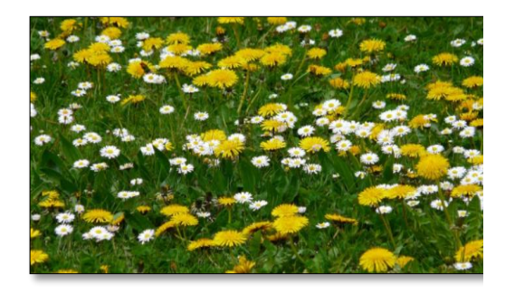
Graiguenamanagh Relief Road early summer 2022

The above changes have already yielded very positive dividends with an abundance of Dandelions and Daisies on display in early summer, with locations such as the Kilkenny Ring Road and Graiguenamanagh Relief Road looking particularly good.