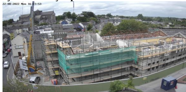
Mayfair Exhibition Area