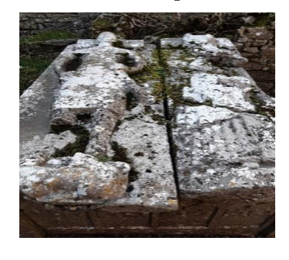
The MacGiolla Phadraig Tomb, Grangerfertagh will be addressesd in the Conservation Plan

Grant aid of €26,200 to prepare a Conservation Management Plan for the medieval church and graveyard which will provide a vision, policies and actions to help protect and conserve the site for future generations. The project is scheduled to be tendered in September 2022.