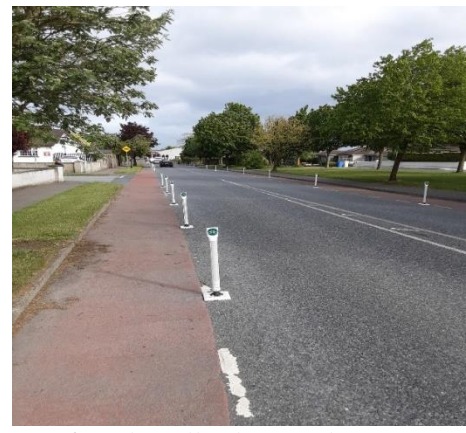
Provision of Cycle Bollards on Bohernatounish Road