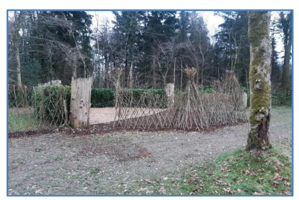
Pruning of willow tunnels around the sand pit in the playground at Woodstock

Work also too place in the natural play area where the willow tunnels which offer a fun natural element to the play area were pruned back. Further elements will be added to this play area this year with funding available for a sensory play area and accessible playground equipment from the Disability Participation and Awareness Fund.