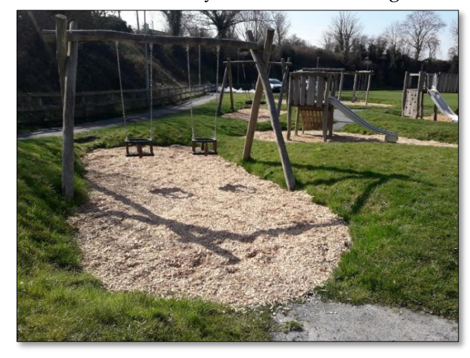
Goresbridge playground with newly laid impact absorbing surface

Elsewhere around the County on-going maintenance continues in our playgrounds. This involves the upgrade of the impact absorbing surface which is critical to the operation of playgrounds. Bark chip is commonly used and must be kept clean and to the desired depth at all times. Considerable effort goes into ensuring this is the case with weekly checks and cleaning.