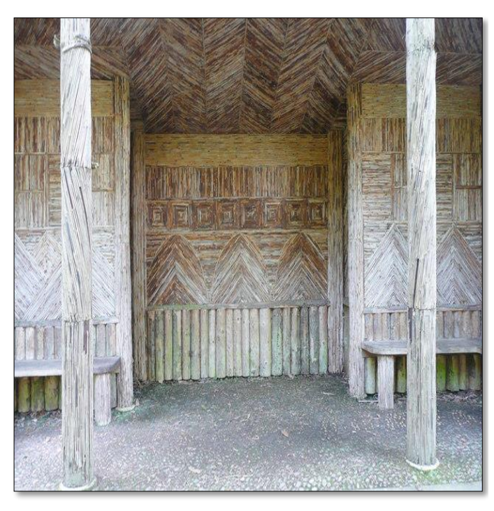
Knox's Bower Summer House

The upgrade of the herbaceous border is scheduled to take place after the Easter holidays. Knox's Bower Summer House has been repaired where bamboo was damaged on the decorative walls. All materials were sourced from the gardens and skilfully applied to this unusual garden folly.