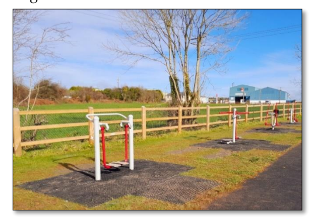
Recently installed outdoor gym equipment & outdoor activity trail at Slieverue Linear Park

provision of a basketball area were recently for pricing.