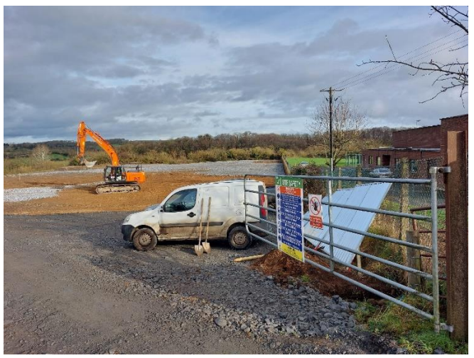
Works at Troyswood

Works are continuing on the upgrade of Troyswood water treatment plant. The upgrading and increase in capacity at the treatment plant at Troyswood will equip the plant to become the primary water treatment plant facility for Kilkenny City.