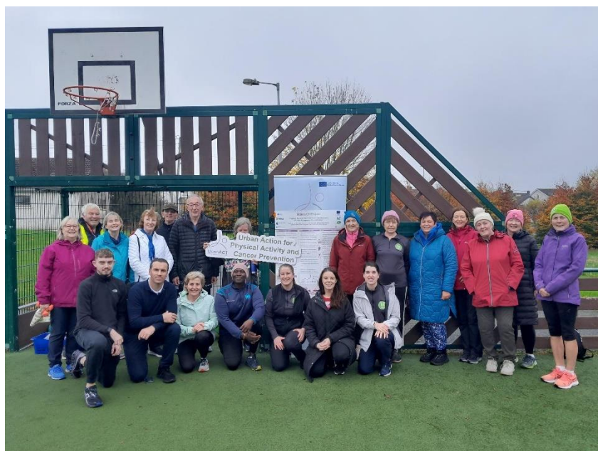
UcanACT programme, Newpark Fen, Kilkenny

In 2024, Kilkenny County Council received €14,000 to implement the Local Authority Period Dignity Initiative . Under this initiative, the provision of free period products was made available in Kilkenny County Council Public Toilet Facilities, Local Parks and Kilkenny County Council Library Services. A local small grant scheme was also made available to Ossory youth, Foroige and Kilkenny Traveller Community Movement.