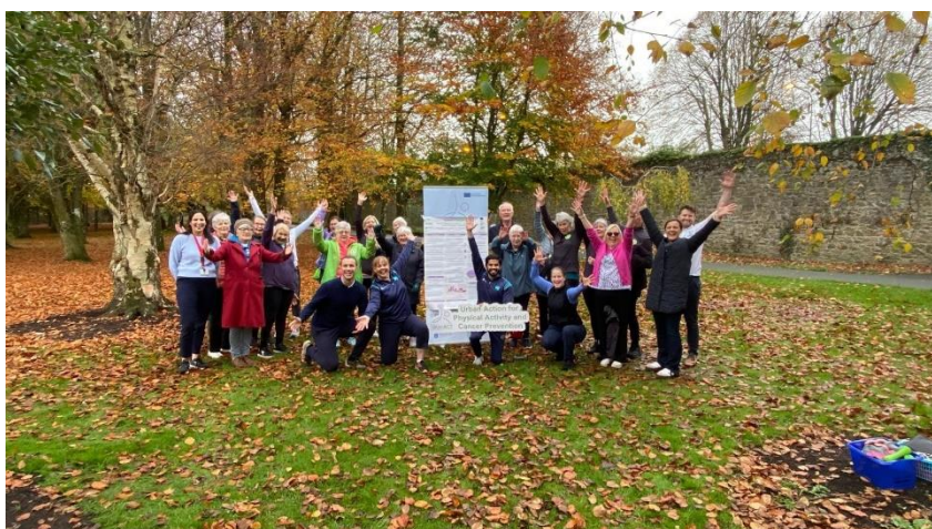
UcanACT programme, Castle park, Kilkenny

physios from the University of Limerick and local Community Managers. The UcanACT Physical Activity App which was developed by one of the project Partners was piloted alongside the programme to explore if the App influenced physical activity patterns in between the exercise sessions. Kilkenny County Council in collaboration with the project partners also developed a Citizen Engagement Strategy for the pilot project which provided the tools, methodology and actions required for engaging individuals, encouraging participation and sustaining motivation. In 2025, the evaluation of this project across the three pilot areas will be published. Outcome Measures will include pre and post data on; physical activity levels, quality of life, falls risk, sleep, fatigue and qualitative feedback on overall impact of the programme on health and wellbeing and the association of health benefits and exercising in the outdoors in green spaces